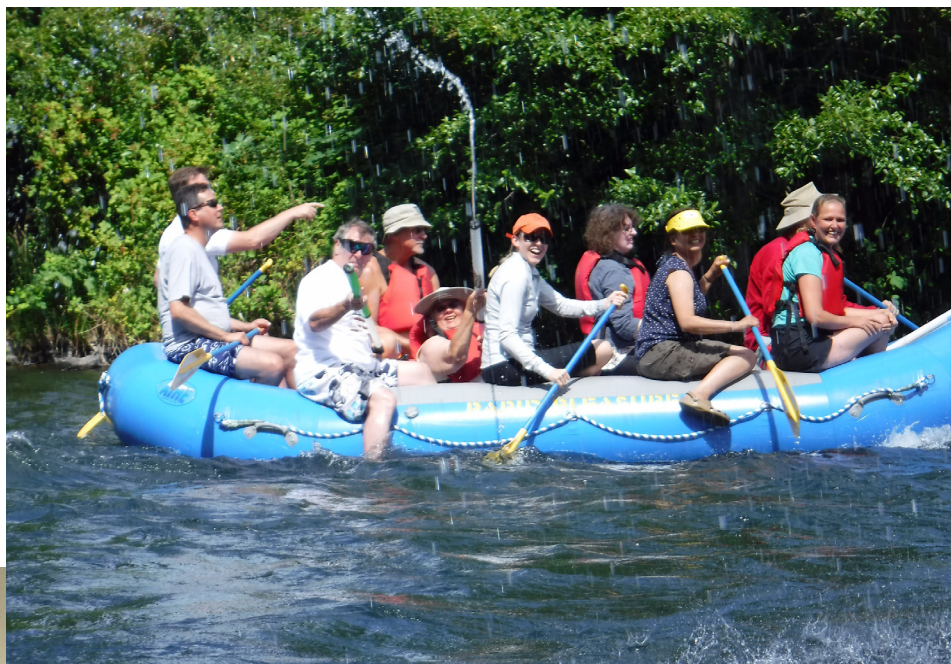
Above: Interpreters and Deaf group enjoy a rafting trip down the Rogue River at Milo Deaf Camp Meeting.

Mark your calendars! In two years, 2018, we will be holding the conference at Cohutta Springs with Souther Deaf Camp Meeting. Hope to see you all there!