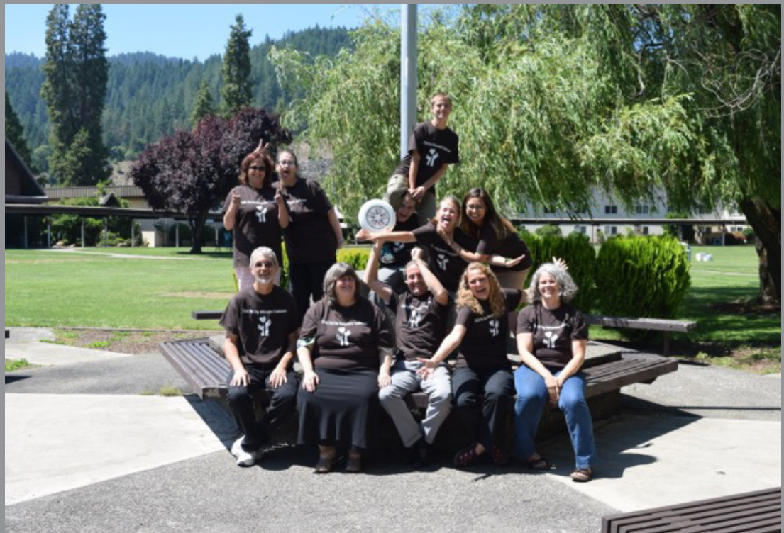
Interpreters conference attendees at the flag pole on the campus of Milo Adventist Academy in July.

The Monday evening was spent sitting in a circle for several hours and having a candid conversation on what was successful in Deaf Ministry in various churches and what were the struggles. We were blessed with deaf participation that helped to guide our conversation. All left the conversation having felt richly blessed by sharing.