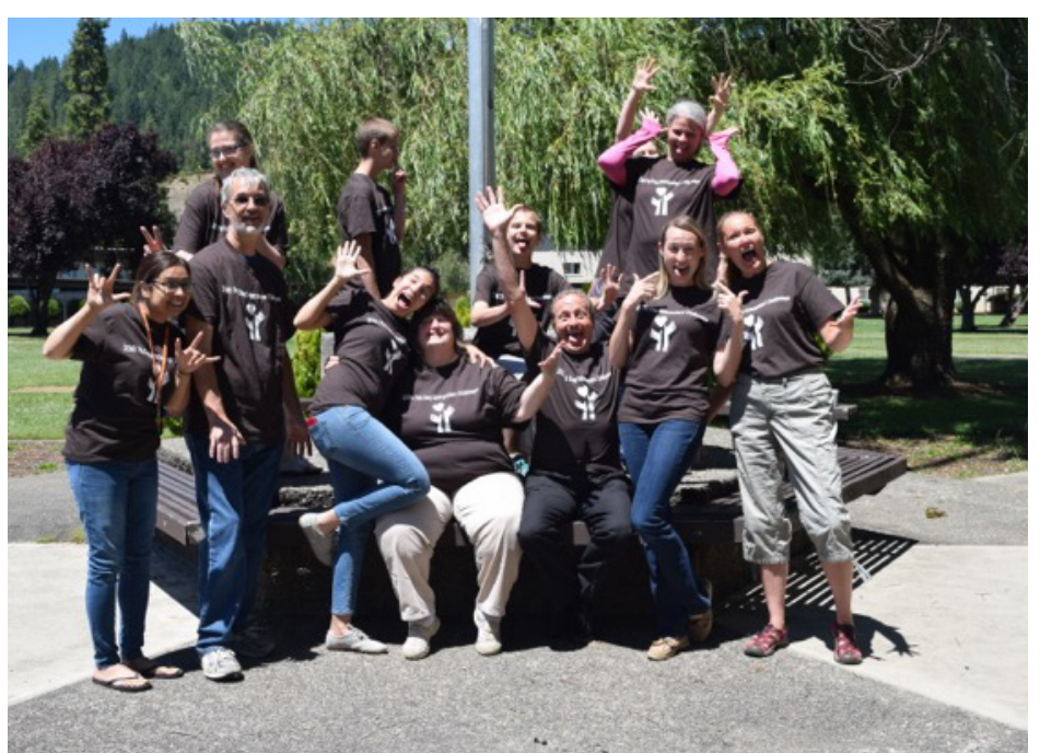
Interpreters pause conference workshops for a silly picture at the flag pole on the campus of Milo Adventist Academy in July.